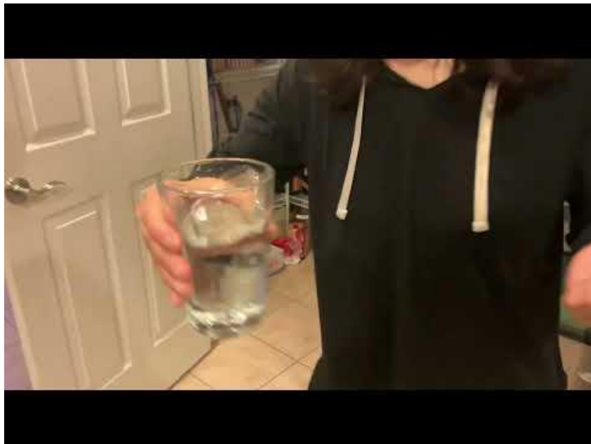
Without using the SpillNot