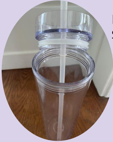
Maars Drinkware Skinny Tumbler