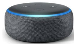
Echo Dot (3rd Gen) Smart Speaker AMAZON