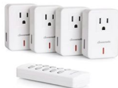
Remote Control Outlet Plugs DEWENWILS