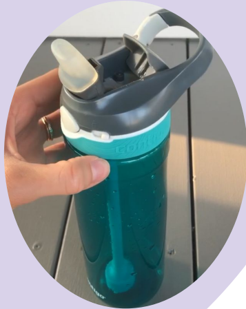
Contigo Autospout Ashland Water Bottle