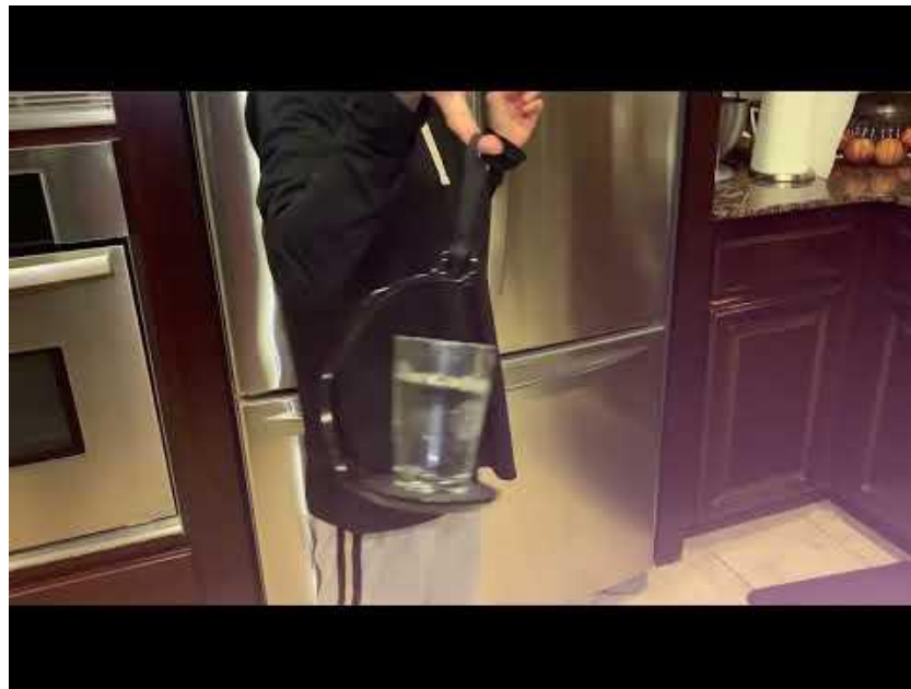
Using the SpillNot