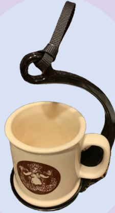
The SpillNot Drink Carrier (left) and the SpillNot holding a mug (right)