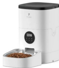
Automatic Pet Feeder PETLIBRO