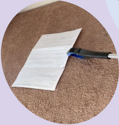
The reacher-grabber device (right) and the device picking up a piece of paper (left)