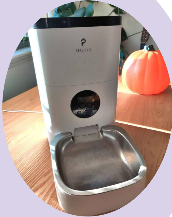
Automatic Pet Feeder