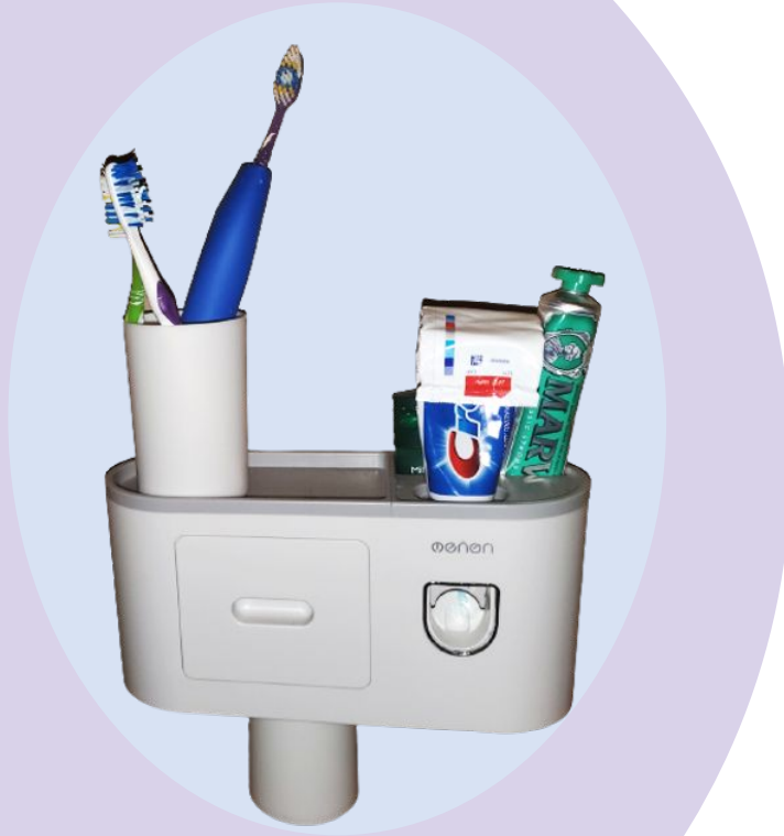
Toothbrush holder and dispenser