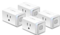
Kasa Smart Plugs KASA SMART STORE