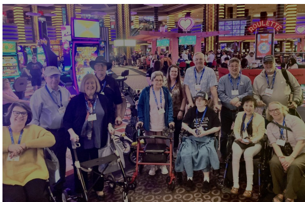
NAF MEETUP IN LAS VEGAS 2023